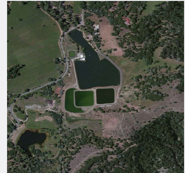
WASTEWATER TREATMENT PLANT PONDS